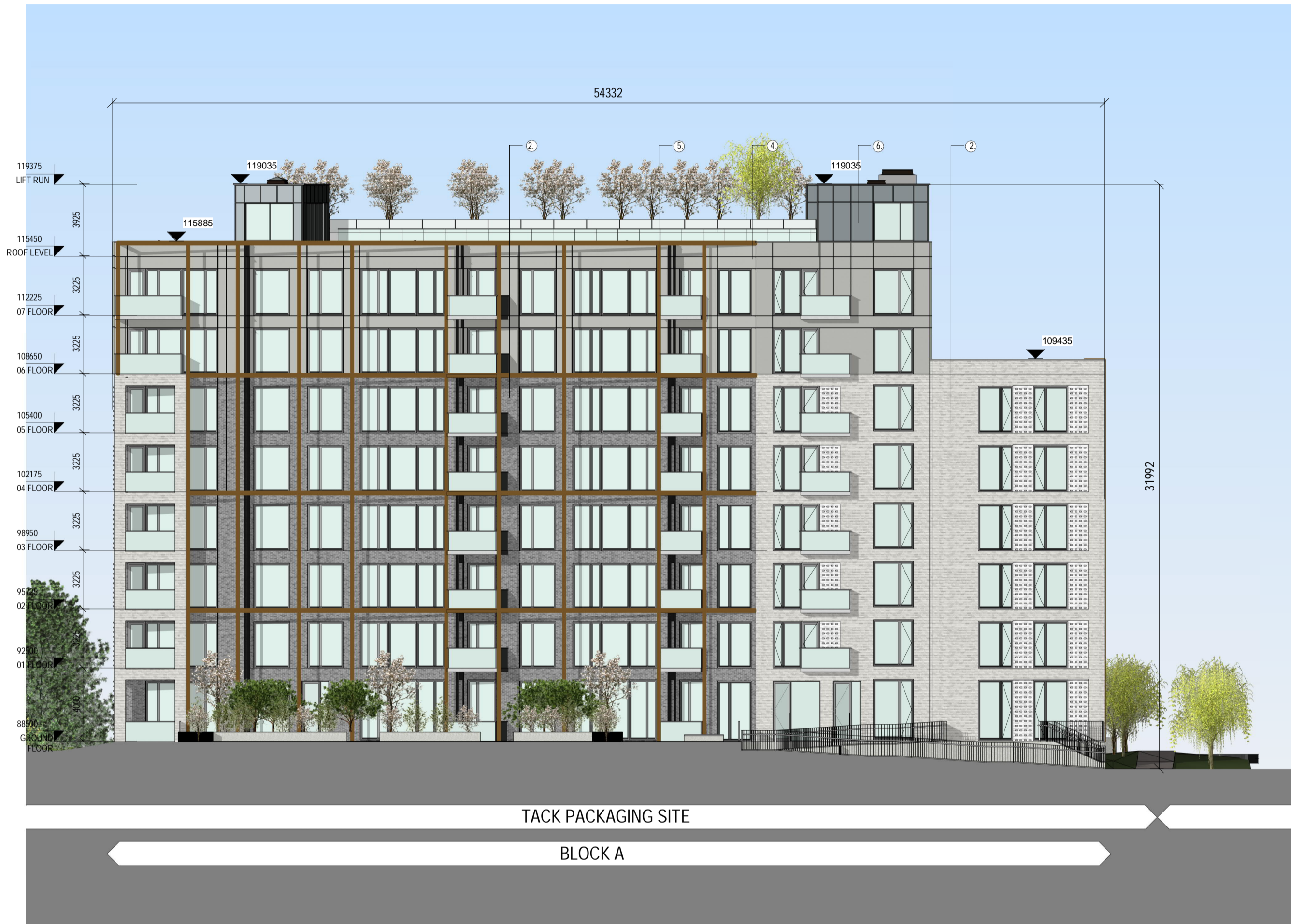
1 PROPOSED COURTYARD ELEVATION 05 - TACK SITE Scale: 1 : 200